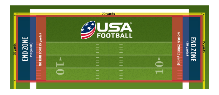
*Yellow line indicates lines of a soccer field